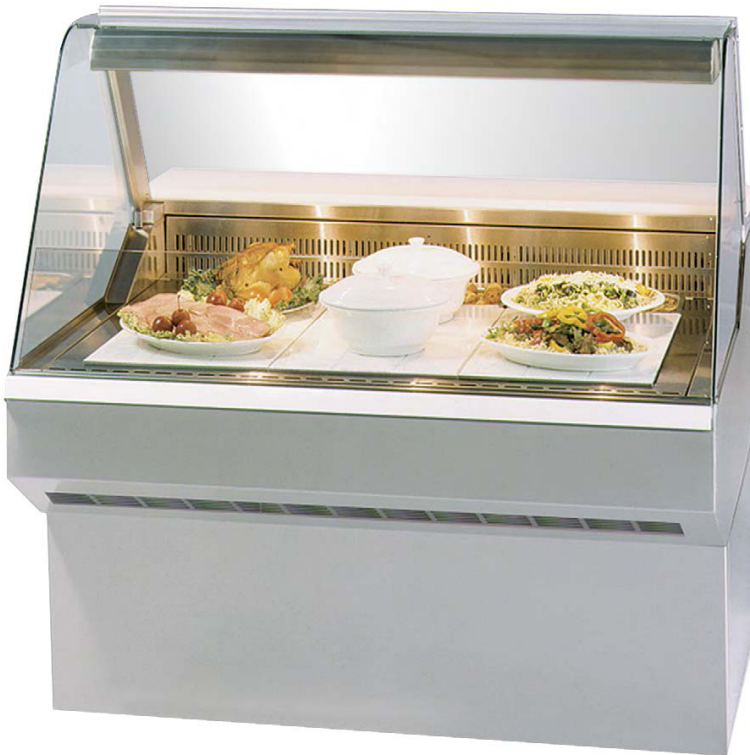
Panel base shown.

Market Deli. The low profile merchandiser that provides solutions to your fresh food merchandising needs. Designed for continuous case line-ups without middle end glass.